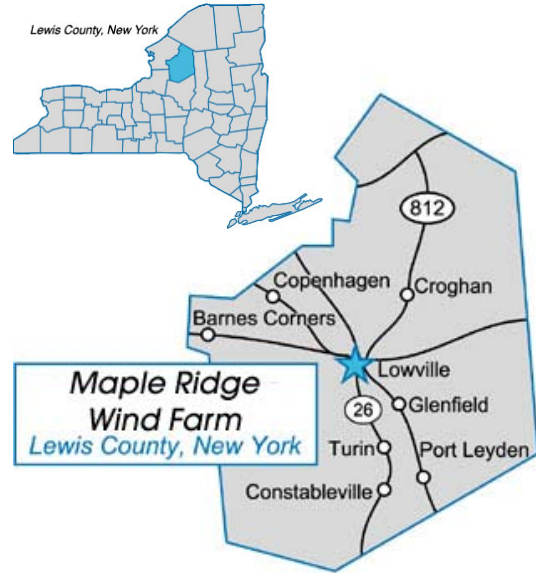
Figure 2. Location of Maple Ridge Wind Farm in New York.

Maple Ridge has been developed in two phases and now currently has 195 wind turbines producing enough energy to run 98,000 homes (500 homes per turbine) (Hinkleman 2007).